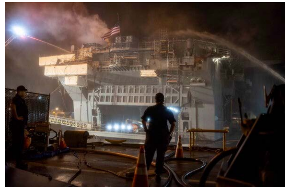
Sailors combat a fire aboard the amphibious assault ship Bonhomme Richard (LHD 6) on July 13 in San Diego.

The Bonhomme Richard fire, which experts fear may have damaged the "big deck" amphib beyond repair, raised troubling questions about how prepared sailors are to combat one of their most fearsome enemies: a shipboard fire, a threat they are trained to deal with from their earliest days in Boot Camp.