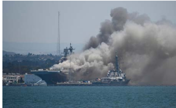
Smoke rises from the USS Bonhomme Richard at Naval Base San Diego Sunday, July 12, 2020, in San Diego after an explosion and fire Sunday on board the ship at Naval Base San Diego.

U.S. Navy brass is telling sailors and contractors to put fire safety at the center of their work in the shipyards and on the waterfront in the wake of a catastrophic fire aboard the amphibious assault ship Bonhomme Richard .